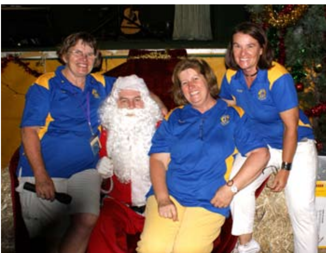
For Lions club members eyes only . I hope you all enjoyed the front page of the Cecil Plains Crier, December edition.

It has been a very well organized event, Thanks to a mammoth fun raising effort from some Lions members it was a most successful event.