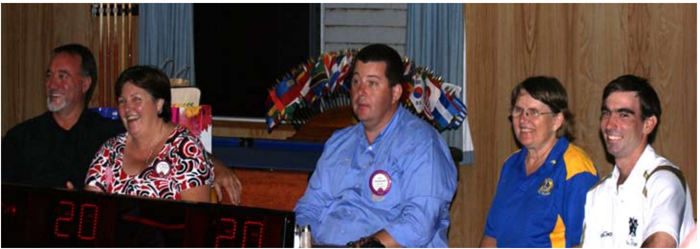
Cecil Plains Lions taking the leading position in the Zone Trivia

to have a crack at answering trivia questions just come along to the next Zone meeting and I will ensure you get a go. The next Zone meeting is at Jandowae on Monday 22nd March. Knock me over in the rush to come!